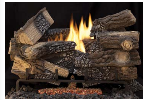
Massive Mixed Oak

The Tri-Flame Series brings a remarkable new technology to the field of vent-free gas logs. To duplicate the look of a real wood fire, these models include a glowing, coal bed at its base. The bright, glowing coals and flickering embers are achieved through the use of two unique technologies. The Tri-Flame burner offers the unusual feature of an additional row of flames behind the logs. The result is a distinctive appearance with a very deep flame pattern.