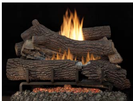
Indoor - 30" Southern Comfort Log Set & 24"/30" Magniflame Burner

Above Right: 36" Southern Comfort Log Set with 36" Magniflame Outdoor Stainless Steel Burner and optional MFEB Lava Rock Flame Bed shown in a massive 50" Masonry Firebox.